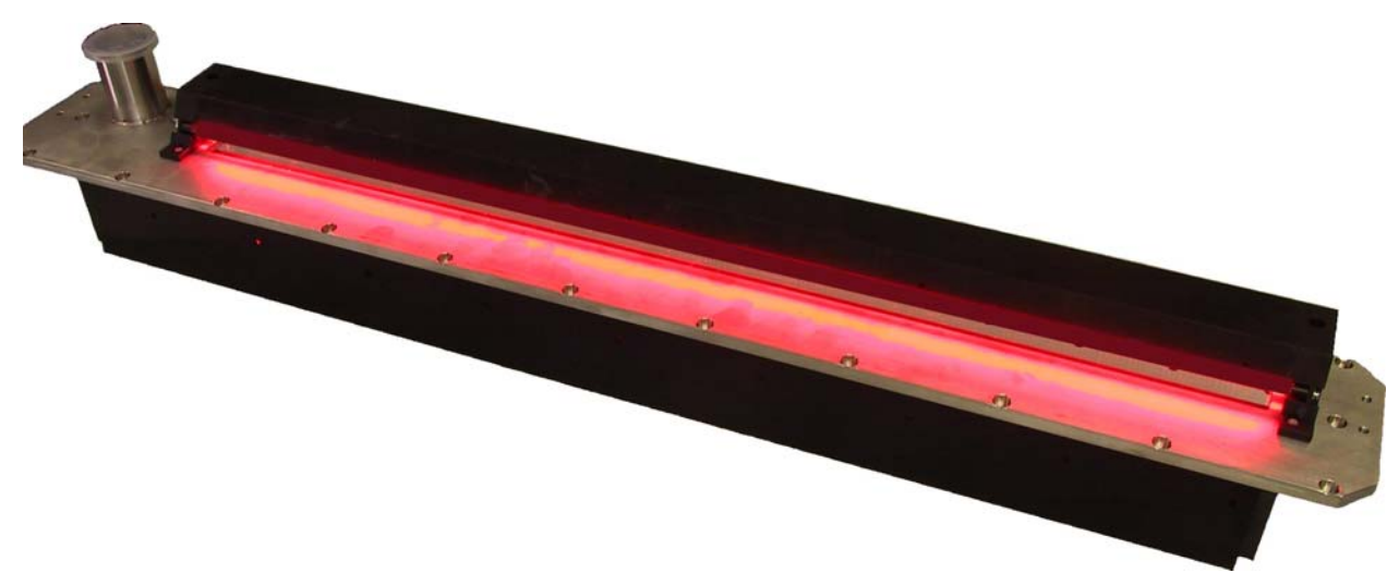
Fig. 1: Mechanical design of the DISS sensor